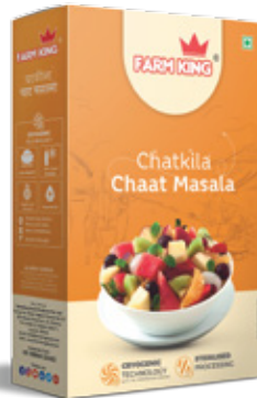
Chatkila Chaat Masala