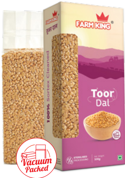
Toor Dal (तुअर दाल)