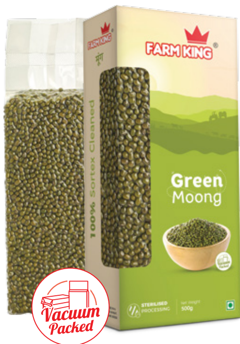
Green Moong (मूंग)

First time in India “Sterilized and Vacuum Packed Lentils” that provides, longer shelf life, Hygiene and Ease of storage.