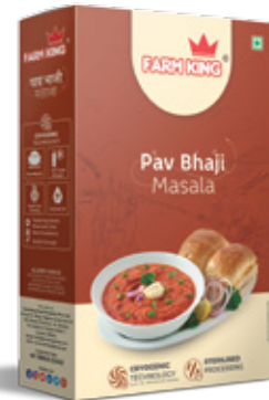
Pav Bhaji Masala