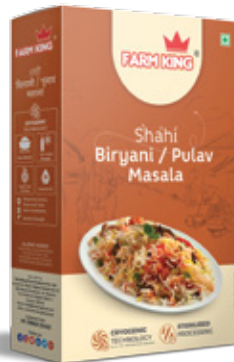
Shahi Biryani / Pulav Masala