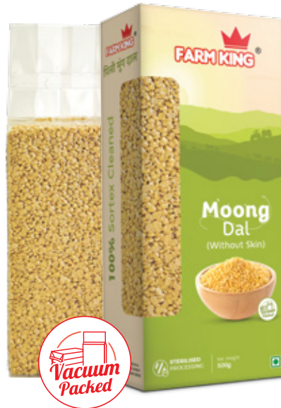
Moong Dal without Skin (पीली मूंग दाल)