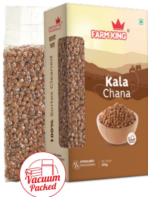
Kala Chana (काला चना)