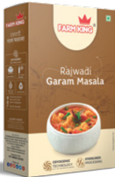
Rajwadi Garam Masala