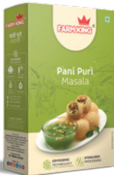
Pani Puri Masala